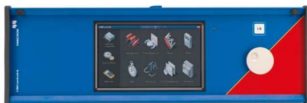
CMControl-6 Front Panel Control (option)

Besides its operation with the powerful Test Universe software running on a PC, the CMC 356 can also manually be controlled with the highly flexible CMControl unit and the CMControl App running on an Android Tablet or a Windows PC. For more information please visit our website.