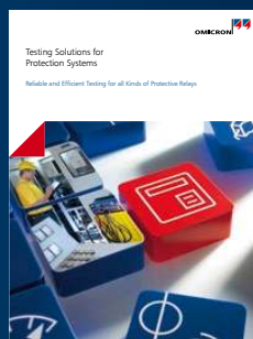
Testing Solutions for Protection Systems

For more information, additional literature, and detailed contact information of our worldwide offices please visit our website.