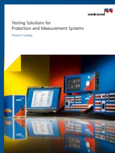
Product catalog (secondary equipment)

The following publications provide detailed information on the products described in this brochure and their applications: